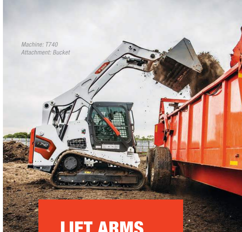
Machine: T740 Attachment: Bucket

An auto-idle function on machines equipped with Selectable Joystick Control will reduce noise levels.