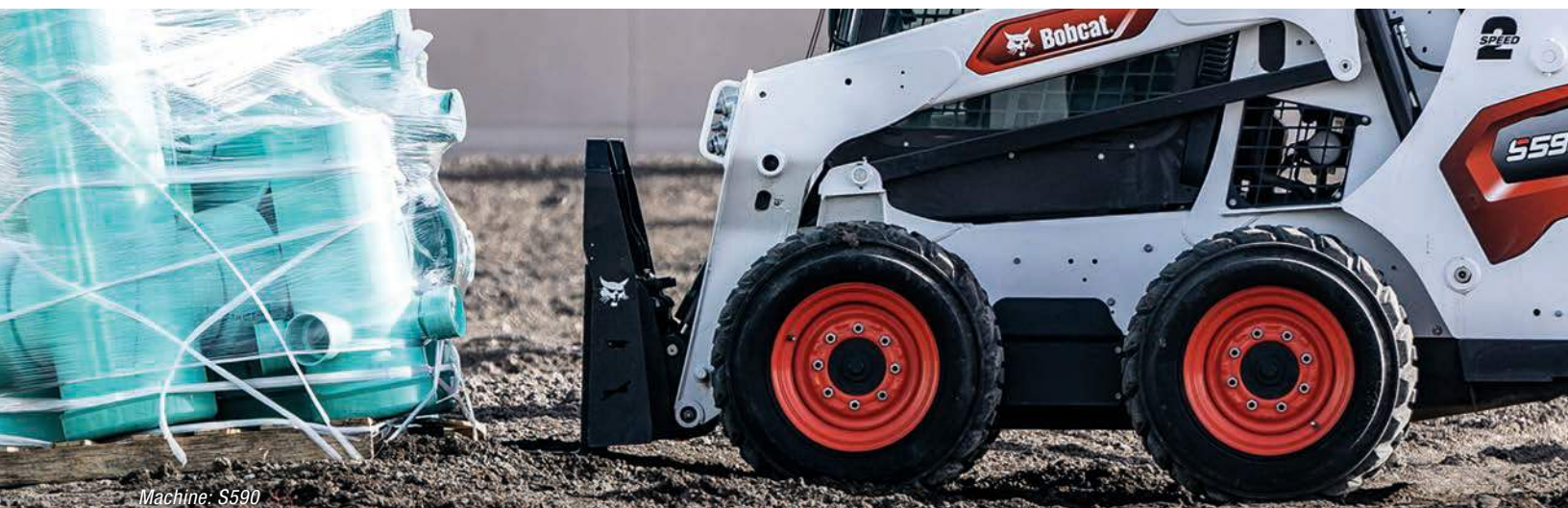
Machine: S590 Attachment: Pallet Fork

The Bobcat chaincase requires no adjustments – ever. Strong chains. Tight manufacturing tolerances. Endless roller, high-strength oval chains (HSOC). Thick side-link plates and hardened pins. The chains are 38% stronger than the competition.