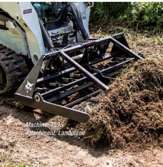
Machine: T595 Attachment: Landplane

With the Power Bob-Tach® system, you can change non-hydraulic attachments without leaving the comfort of your cab. Just line up the attachment and press the switch.