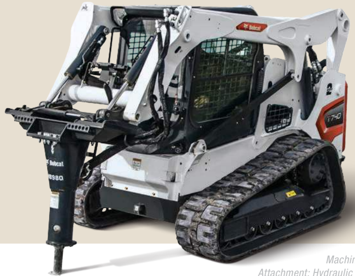
Machine: T740 Attachment: Hydraulic Breaker

The Bobcat track undercarriage is a solid-mounted, fully enclosed design that protects components such as hoses and drive motors. Solid-mounted undercarriages have fewer moving parts, which reduces maintenance and provides a solid base for the loader and work group.