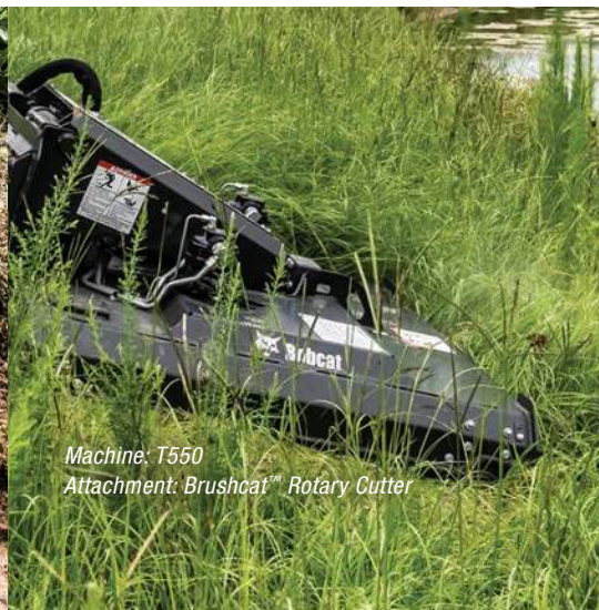
Machine: T550 Attachment: Brushcat™ Rotary Cutter