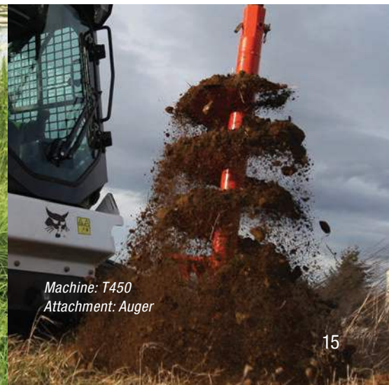
Machine: T450 Attachment: Auger