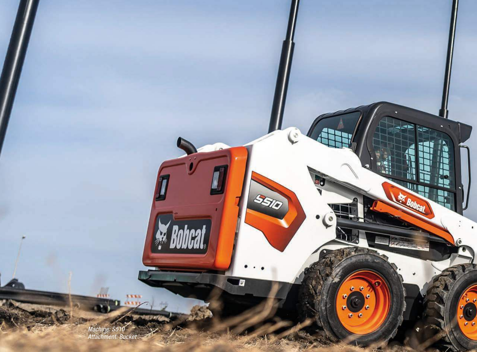
Machine: S510 Attachment: Bucket